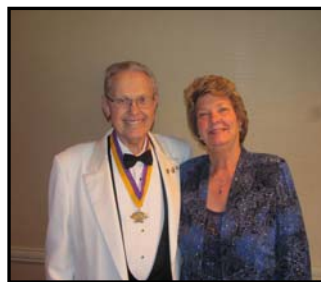
Governor's dinner on Saturday night .