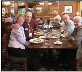
Dinner Friday Night.