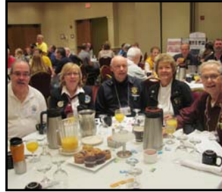
Sat. AM Awards Breakfast