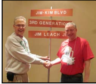
Friday night Party room